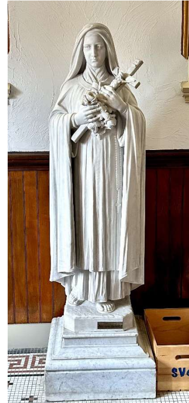
St. Therese Statue

St. Therese of Lisieux reminded us that that God loves us and wants us to trust Him, like little children trust their parents.