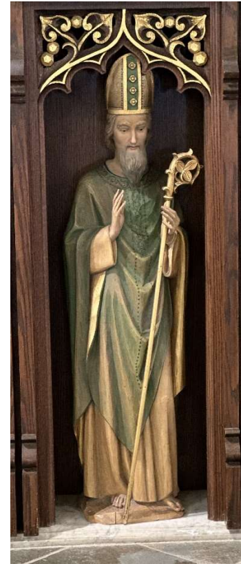
St. Patrick Statue

Saint Patrick , our Church's patron saint, helped the people of Ireland to know and love Jesus.